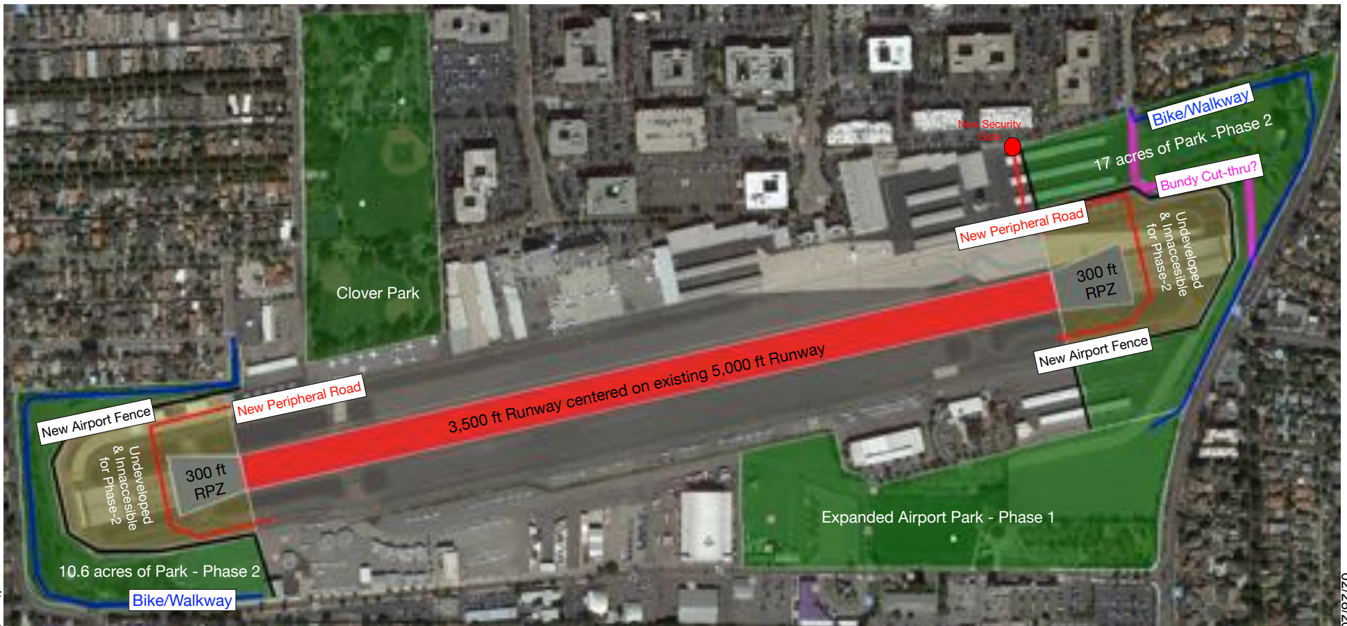
Fig-3 - Details of Potential Phase-2 Park Land