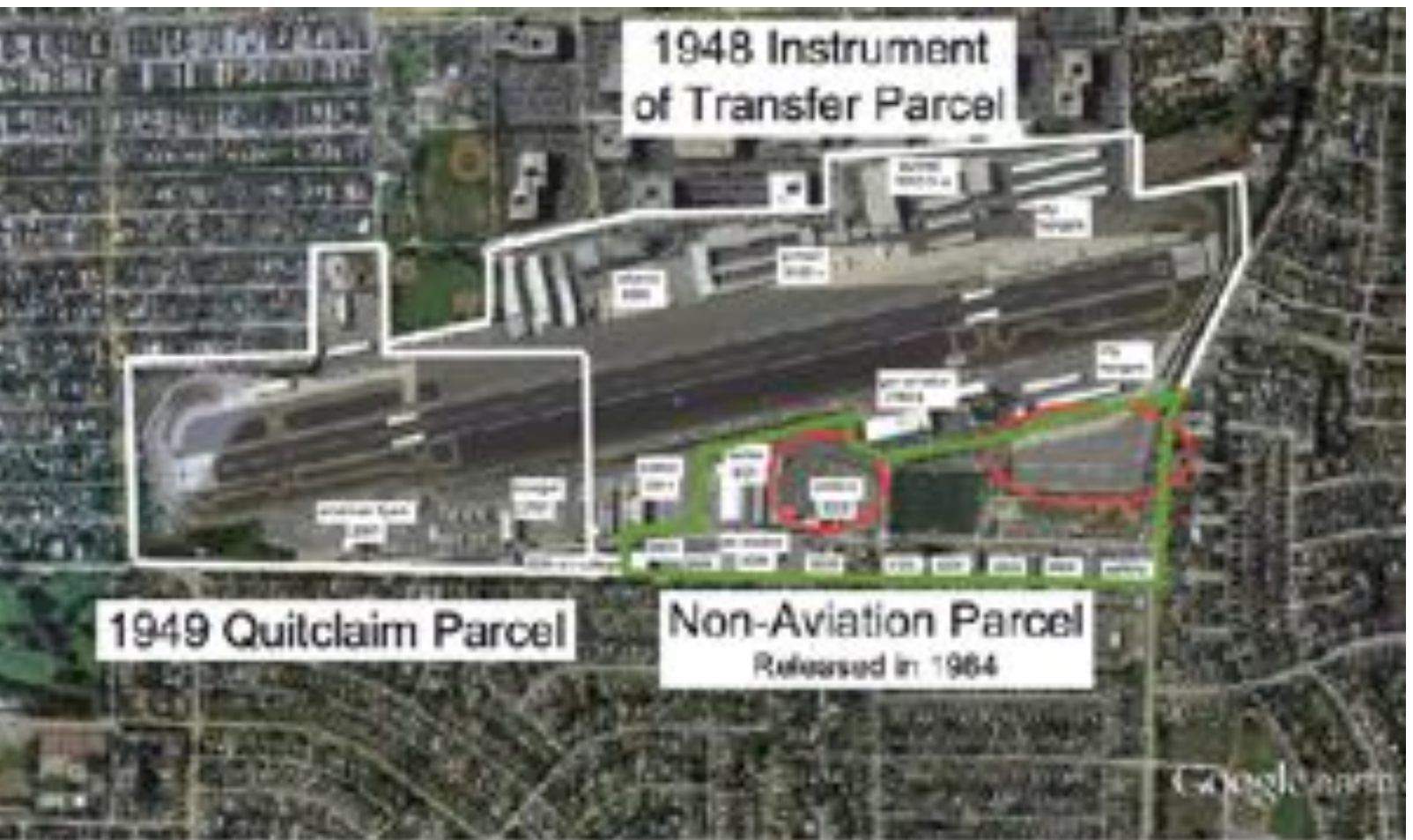
Fig-1 - Airport Parcels Showing initial 12 acres (from Jan 2015 document)