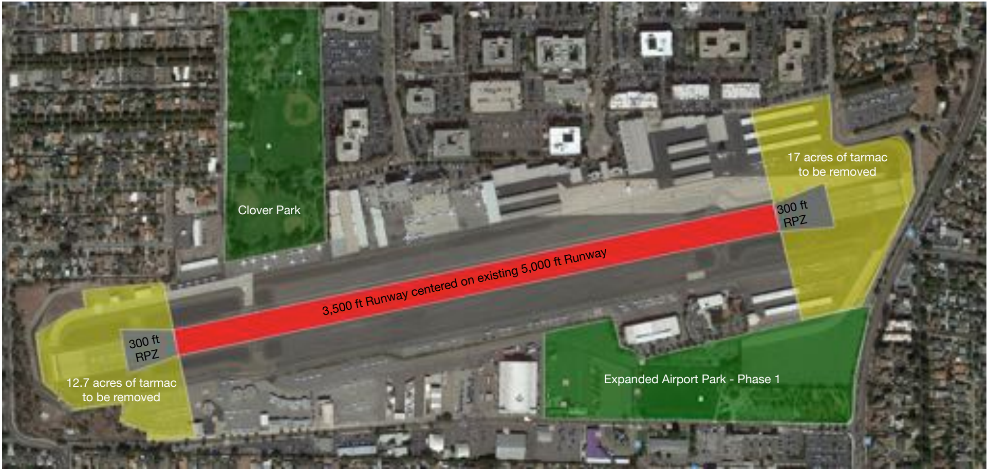
Fig-2 - Airport Layout Following Runway Shortening