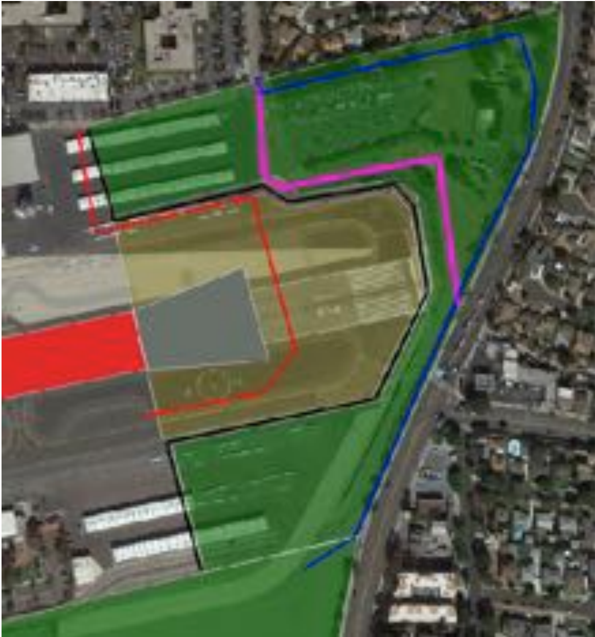
Fig-5 - Detailed view of Eastern End Phase-2 Park Space (17 Acres)

Figure 5 above shows a detailed view of the proposed additional park space at the Eastern end per the suggested configuration of the revised airport footprint. Just as for the changes at the Western end, the existing airport peripheral road (seen just inside the proposed inner park boundary) is at the top of a slope that falls from the airport surface down to the level of Bundy. This slope is already in its natural state consisting of scrub, trees and vegetation along the hillside.