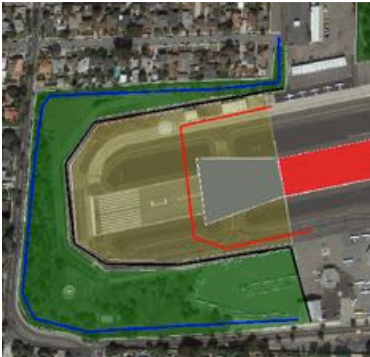
Fig-4 - Detailed view of Western End Phase-2 Park Space (10.6 Acres)

Figure 4 above shows a detailed view of the proposed additional park space at the Western end, and of a suggested configuration of the revised airport footprint. The first point to realize is that the existing airport peripheral road (seen just inside the proposed inner park boundary) is at the top of a slope that falls from the airport surface down to the level of 23rd street. This slope is already in its natural state consisting of scrub, trees and vegetation along the hillside. The proposal is to move the existing airport perimeter fence (the black line) to just inside this peripheral road, making the road the uppermost limit of the park. This avoids the need to